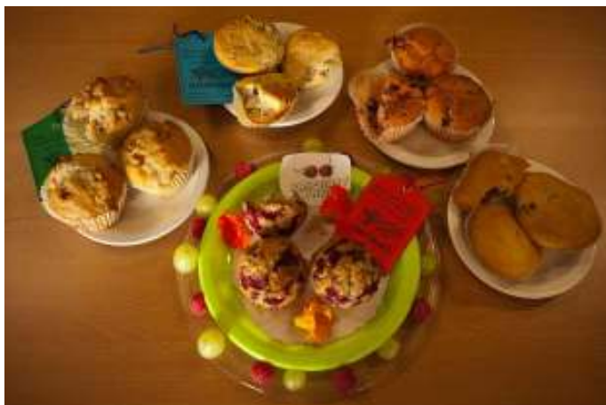
Pre-school - P4 Entries